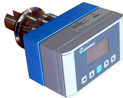
SONATEC Transmitter Version

The speed of a sound pulse between a transmitter and a receiver is measured. The sound pulse is created by piezo-elements and moves perpendicular to the product flow. Based on the correlation between concentration and sound velocity, the concentration of the 2-component liquid is calculated and displayed.